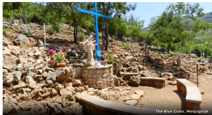
The Blue Cross, Medjugorje