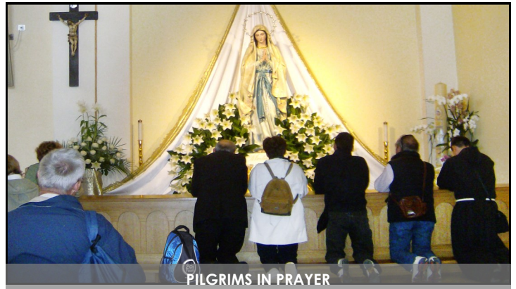
PILGRIMS IN PRAYER

Round-trip airfare All airport taxes & fuel surcharges 6 Nights in a modern Pansion/Hotel in Medjugorje: Nov 5—Nov 11: Hotel Dubrovnik, Medjugorje or similar Breakfast and Dinner daily Wine and mineral water with dinners Assistance of a local professional guide throughout Tour Escort Transfers as per itinerary Entrance fees as per itinerary Mass daily and Spiritual activities Visit to Community Cenacolo & Meeting with visionaries (Pending availability) Luggage handling (1 piece per person) Flight bag & portfolio of all travel documents